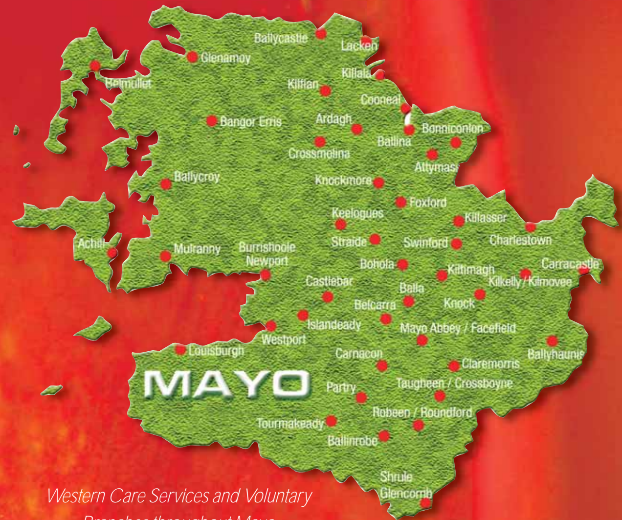
Western Care Services and Voluntary Branches throughout Mayo 1966 - 2008